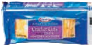
A. Kraft® Cracker Cuts 5-7 oz, $2.68