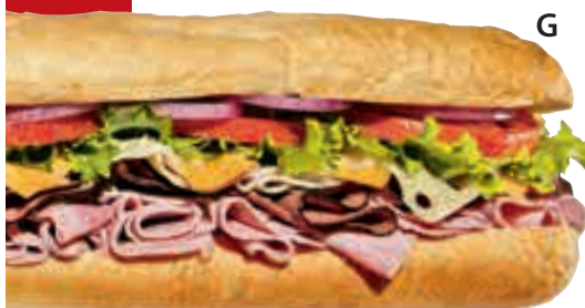
G. Marketside™ Super Sub 24 oz., $5.98 Available in our fresh Deli.