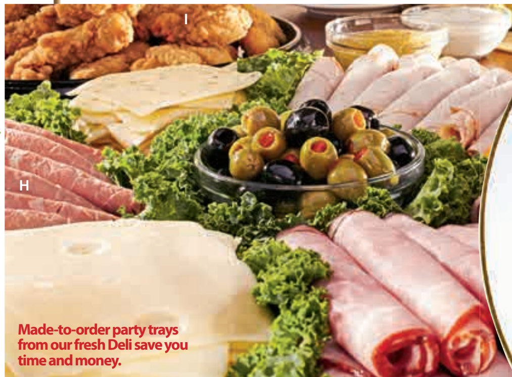
I. Chicken Tenders Party Tray Serves 20-25, 5 lbs., $25 Available in our fresh Deli.

Made-to-order party trays from our fresh Deli save you time and money.