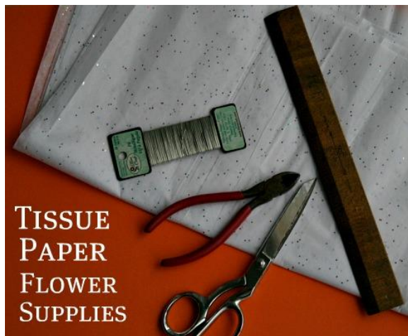
TISSUE PAPER FLOWER SUPPLIES